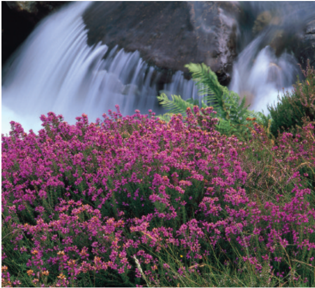
Vibrant purple heather adds colour to this summer scene of a stream rushing down the slopes from Llyn Idwal.