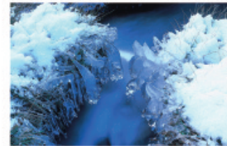
Transparent ice coats stream-side grasses.