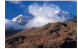
Wells of mist swirl around the summits of Snowdon (in Wyddfa) and Crib Goch.