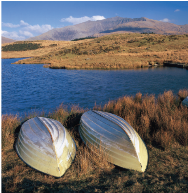
Two fishermens' boats beside Llyn y Dywarchen near Rhyd-Ddu. Snowdon and its western cwms dominate the skyline ahead.